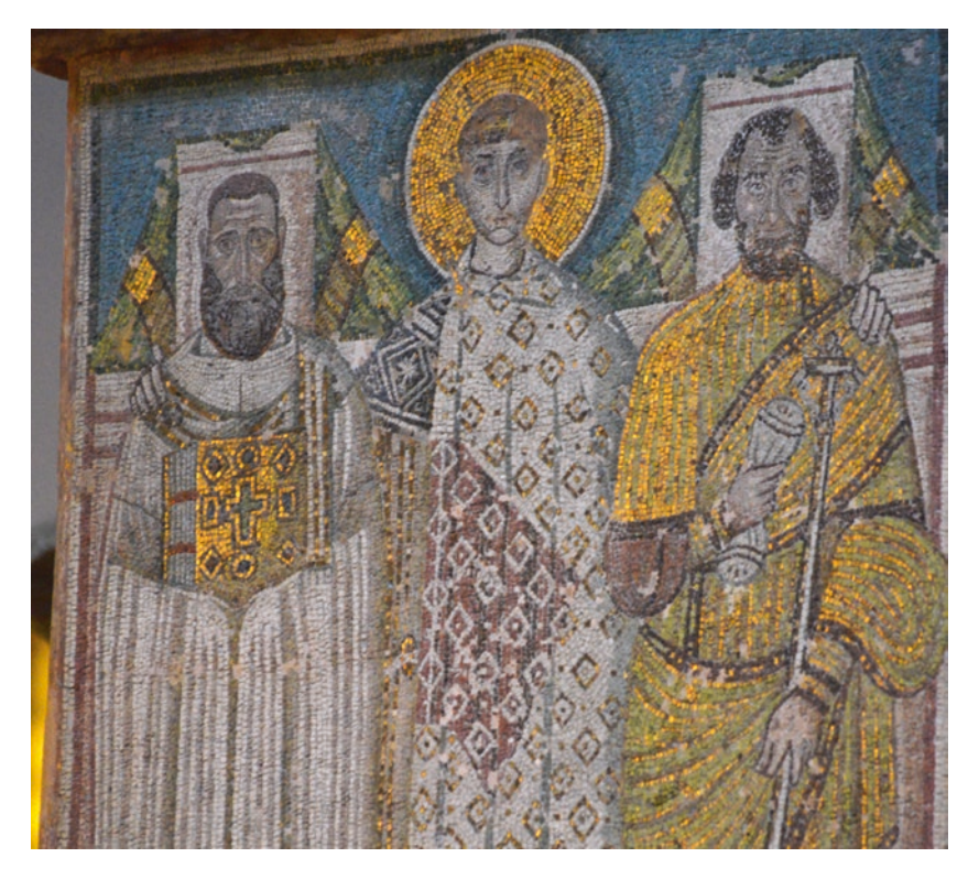
Fig. 2.1 Mosaic of Saint Demetrios (late seventh century) with the Bishop of Thessaloniki and the Eparch Leo, in front of the city walls. Saint Demetrios Church, Thessaloniki

(Foss 1977b, 78–9) or those embellishing the walls of Attaleia celebrating Emperor Leo VI (886–912) as taking care even of his most distant subjects (Krallis 2019, 60). More important, however, and as clearly signified by the famous seventh-century mosaic panel in the church of Saint Demetrios of Thessalonike (see Fig. 2.1) representing the Saint as embracing the Patriarch and the Eparch (as donors of the ecclesiastical building) in front of the city walls, we are confronted with the emergence of a new conceptualization of the city from the seventh century on. It reveals an increasing need for fortification and security (Bakirtzis 2005, 26–27). This should be fulfilled practically by impregnable and potent walls embellished